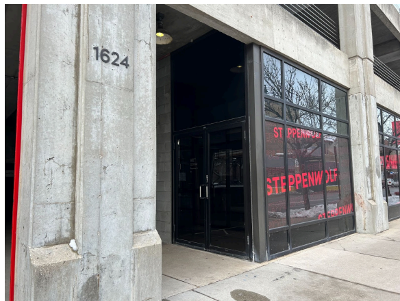
Image: This photo shows the exterior of a concrete parking structure. The garage's vehicle ramp is labeled "EXIT ONLY" in bold black letters on a white background with a red frame. Adjacent to the ramp is the Merle Reskin Space entrance featuring large windows covered with red "STEPPENWOLF" lettering. A street number "1624" is mounted on concrete. The overall building is utilitarian—grey concrete beams, exposed structure, and metal rails—with bold, branded accents.

The entrance and theater space itself are both street-level. There is an overhang creating a small vestibule just outside the doors. Note that the external glass doors are manual. –